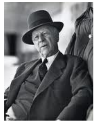
"The Great Wild-